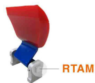
Blade Type PRUS