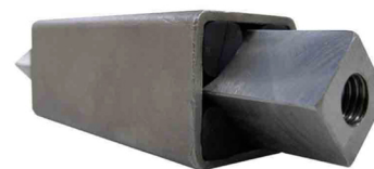
SRTS's blade with RTAM