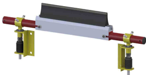
Tungsten Carbide Blade – SBC2