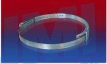
CLAMP 210 BRIDGE CLAMP