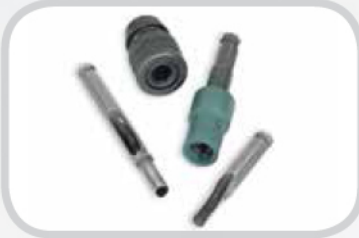
Power installation tools