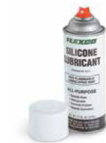
Silicone Lubricant Spray

With a hammer and cracking chisel, individual worn plates can be easily replaced – without resorting to replacement of the entire splice.