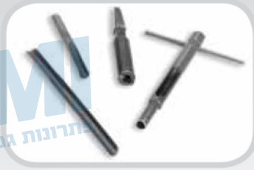
Hand installation tools